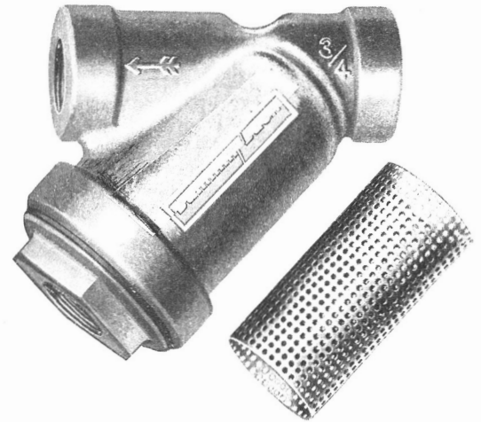
STRAINER, Type SS-A

The MEPCO Strainers are applicable to all types of steam and hot water heating systems. Their purpose is to protect traps, valves, heating elements, pumps, piping, etc. from dirt and scale which are often times the cause of a loss of heating efficiency.